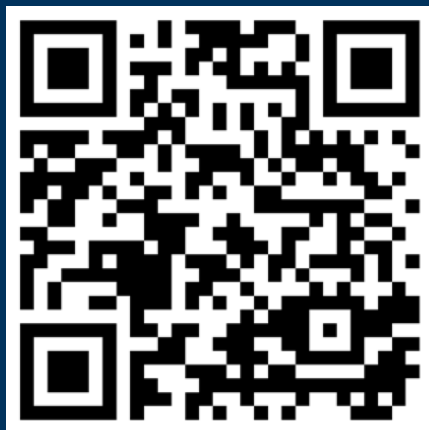
SLW Academy Registration