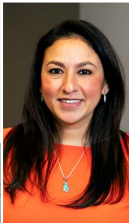
Senior Manager- Docketing & Client Records