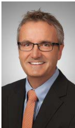
Patent Attorney & Principal