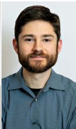
Patent Attorney & Principal