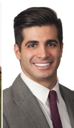
Patent Attorney & Principal